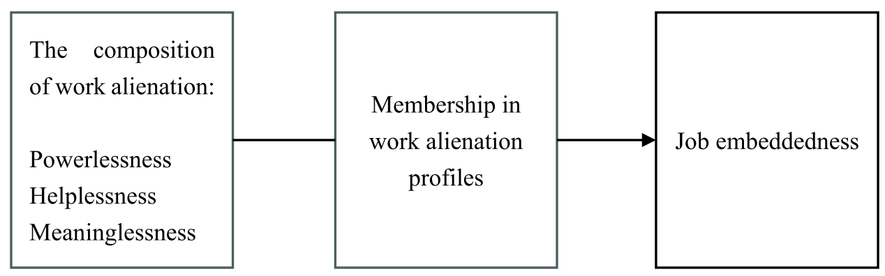
Fig. 1 The relationship between work alienation profiles and job embeddedness

Chen et al. BMC Nursing (2024) 23:122 Page 3 of 13