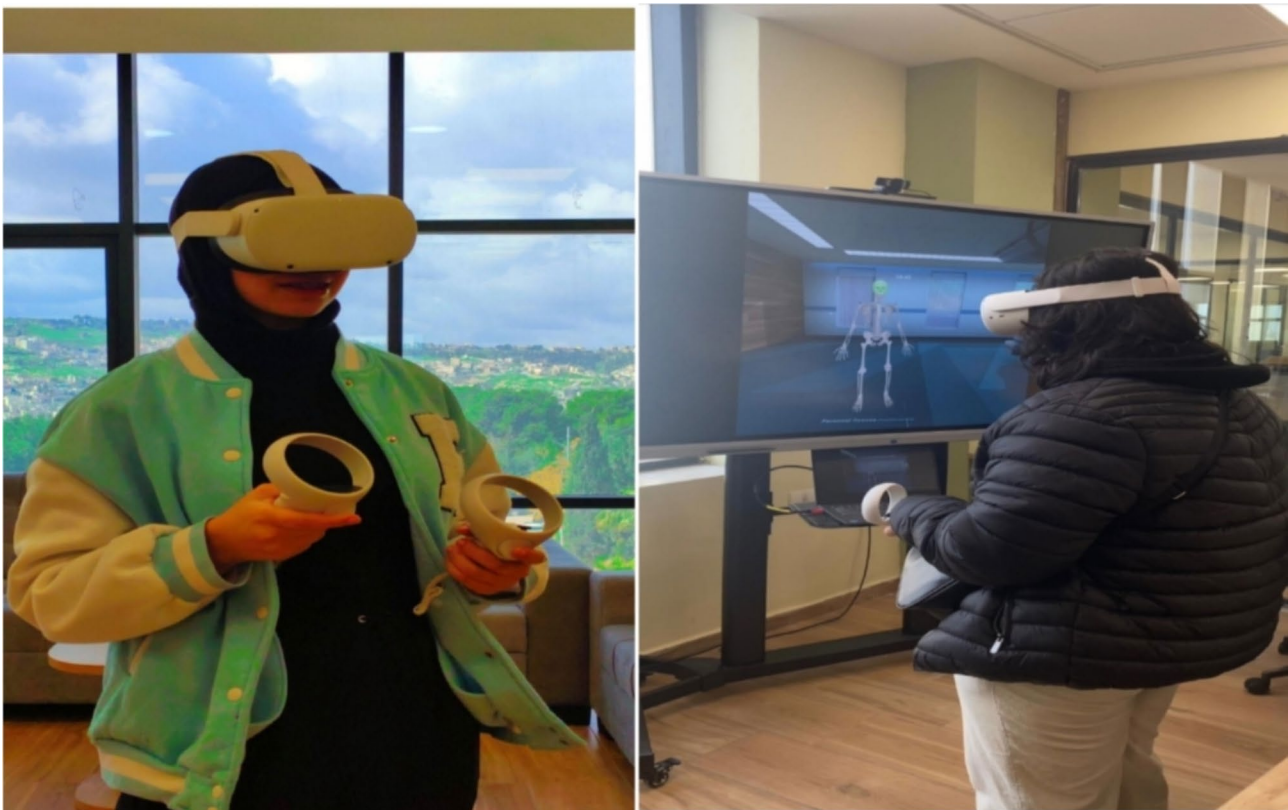
Fig. 1 Nursing students through utilizing VR application (Human anatomy)

After the anatomy lecture (theory; musculoskeletal chapter) , VR application (human anatomy) was performed for the second time after 2 weeks for the same students; each group decided on a day that fit their schedule and did not conflict with any other classes. The same process was conducted, and they were given a link to a Google Form to complete the TAM scale to examine their perceptions toward utilizing the immersive VR (human anatomy VR) application after taking their anatomy lecture. Data collection from participants at the date of the anatomy course, from March 10 to April 26, 2024 was performed (see Fig. 1).